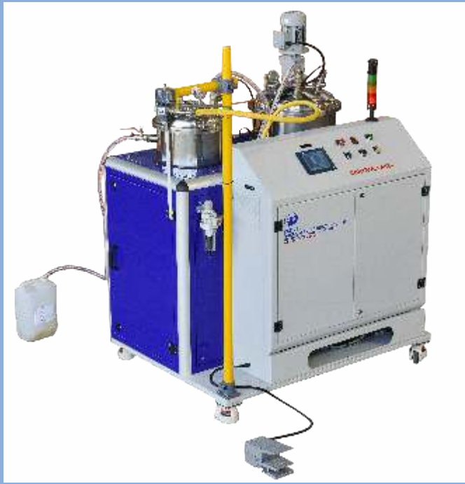
Stand-alone Potting / Encapsulation Machine